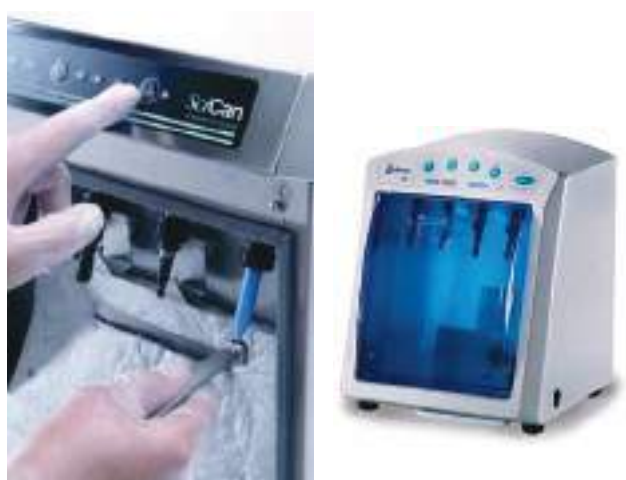
Figure 18. Lubrication stations

Many manufacturers offer an automatic clean and lube station to minimize staff time and take the guesswork out of the maintenance process. These units vary in cost, depending on features. One incentive to purchase an automatic lubrication station would be that some manufacturers will significantly extend their handpiece warranties if their respective automatic stations are used to maintain the handpieces.