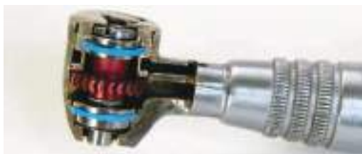
Figure 12. Handpiece turbine assembly

The rotary system consists of an impeller, or rotor, which “catches” drive air (similar to a water wheel), mounted on a spindle. The spindle rotates clockwise at high speeds, supported by two precision bearings and two suspension O-rings.