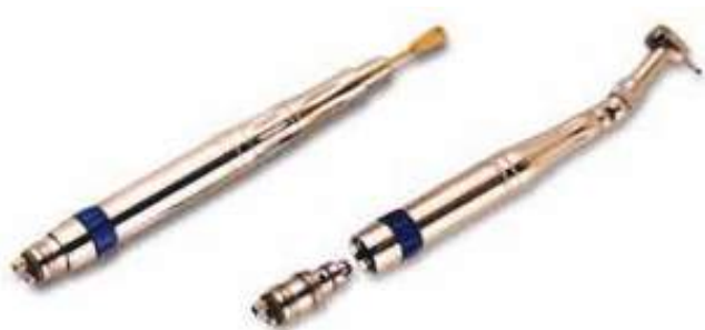
Figure 16. Low-speed attachments

It is very important to take latch angles apart for proper lubrication. If you are processing angles routinely, at least once a day unscrew the head from the sheath and remove the transmission gear for cleaning and oiling (try doing this first thing in the morning as part of the opening routine). Apply a drop of oil under each gear on the transmission gear as well as in the center hole. Apply several drops of oil to the exposed cartridge while the transmission gear is removed.