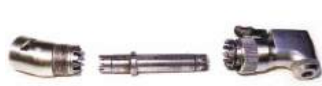
Figure 17. Latch head components

It is very important to take latch angles apart for proper lubrication. If you are processing angles routinely, at least once a day unscrew the head from the sheath and remove the transmission gear for cleaning and oiling (try doing this first thing in the morning as part of the opening routine). Apply a drop of oil under each gear on the transmission gear as well as in the center hole. Apply several drops of oil to the exposed cartridge while the transmission gear is removed.