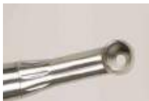
Figure 8. Body or shell