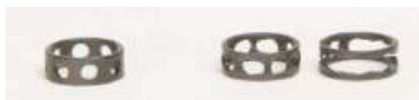
Figure 14. Bearing retainer showing stages of degradation

Improved cage materials and manufacturing processes have extended handpiece life since the advent of routine sterilization, as evidenced by the longer warranties prevalent today. Other design improvements offer the clinician the choice of maintenance-free (“lube-free”) handpieces. This is accomplished by saturating the bearing cage with a food-grade, autoclavable grease that gradually releases onto the ball bearings over time through use and sterilization. The bearings are not really “lubrication free.” They are “maintenance free,” however, as it is no longer necessary for the staff to apply lubricant. One of the latest innovations in dental bearing applications is a bearing cage coated with a layer of pure silver. According to a leading bearing manufacturer, the new silver composite retainers combine the lubricating capabilities of metallic silver with strength and the ability to withstand repetitive autoclave cycles.