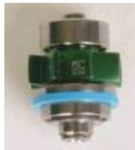
Figure 10. High-speed turbine Figure 11. Effects of wear and sterilization

The component that fails most often on a high-speed air-driven handpiece is the turbine; as this degrades, the handpiece exhibits signs of impending failure that are all too familiar to the dental team.