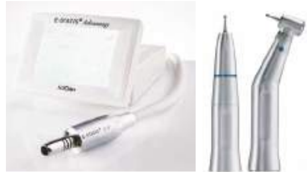
Figure 5. Electric handpiece unit and attachment examples

Any number of attachments with various gearing combinations will connect onto an electric motor. The most commonly used attachment for operative dentistry is a 1:5 step-up referred to as a “high speed” attachment. Most electric motors operate at 40,000 rpm; adding a 1:5 speed-increasing attachment provides 200,000 rpm at the bur. This speed remains constant no matter how aggressively the clinician is cutting, and the advantage is much faster preparation time. There is a learning curve associated with mastering this increased power. Electric attachments are generally universal, meaning that any brand will work with any motor. One exception is the new Comfort Drive ® by Kavo, a more compact design.