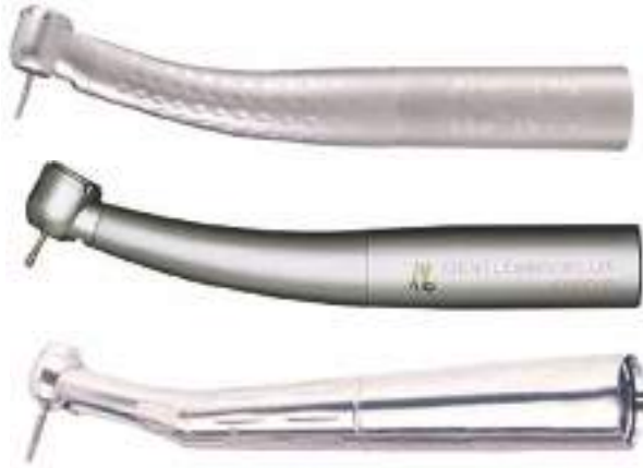
Figure 4. Air-driven high-speed handpieces

Water Delivery: All high-speed handpieces incorporate a water spray as a coolant; the latest innovation is a multiport spray emanating from the face of the handpiece. This provides even distribution of coolant water over the entire surface of the tooth and prevents the water spray from being blocked when cutting is performed on the distal surface of a tooth.